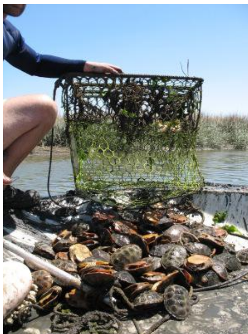
Terrapin carcasses found in abandoned crab pot in Georgia

During Hoyle and Gibbons' (2000) study in South Carolina, the scientists inadvertently created a ghost pot scenario when two of their test pots became entangled during a high spring tide when they were not being monitored (Hoyle and Gibbons, 2000 at 735). Four terrapins entered those pots and died ( Id. ). The scientists estimated that those two lost pots could account for more terrapin captures than all 20 pots set during the study year ( Id. at 736).