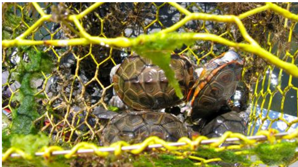
These 4 diamondback terrapins drowned after being trapped in a crab pot.

Crab pot mortality affects terrapin populations by removing mature males and subadult and adult females and hindering the population's reproductive capabilities. While in some places female terrapins may grow too large to enter pots, male terrapins never grow larger than the opening of a crab pot entrance and are susceptible to crab pot mortality throughout their lives (Roosenburg et al., 1997; Chambers and Maerz, 2018). In the southeast, female terrapins do not grow as large as more northern populations and therefore do not grow large enough to avoid crab pot mortality (Chambers and Maerz, 2018). For example, in one Alabama population, 85% of female terrapins sampled were susceptible to crab pot mortality (Coleman et al., 2014; Chambers and Maerz, 2018).