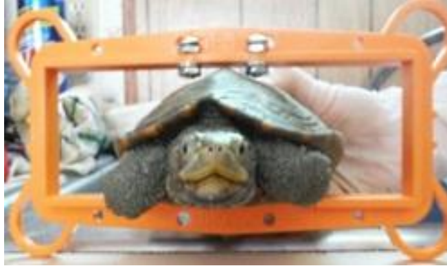
An example of a plastic terrapin excluder device

The effectiveness of BRDs at preventing terrapin death with little to no impact on blue crab capture has been well-studied (Roosenburg, 2004 at 26). There is a general consensus that 4.5 x 12-centimeter (cm) BRDs are effective at reducing terrapin entrapment (Roosenburg, 2004 at 26). Likewise, studies have found that both the 4.5 x 12 cm and the 5 x 10 cm BRD have a minimal effect on crab catch (Roosenburg, 2004 at 26). These findings have been tested in Virginia, with similar results (VMRC, 2023).